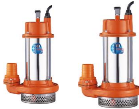
1/2, 1/3 HP